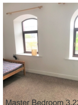
Master Bedroom 3.22m x 4.31m with Fitted Carpet.