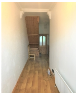
Entrance Hall 7.75m x 1.24m with Original Coving , Oak Flooring and Partial Wainscoting.