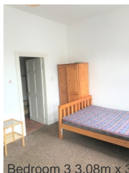
Bedroom 3 3.08m x 3.95m with Fitted Carpet.