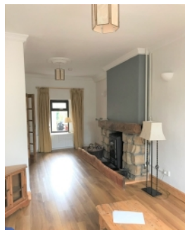
Dual Aspect Windows & French Doors.