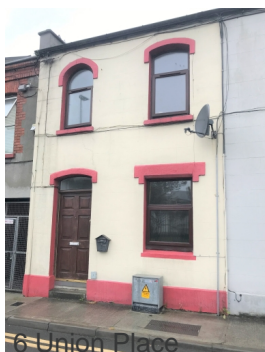
6 Union Place