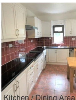
Kitchen / Dining Area 5.08m x 3.06m with a Fully fitted Painted Kitchen , Integrated Appliances , Tiled Splashback , Til