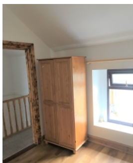
Bedroom 2 3.31m x 2.71m with Oak Flooring