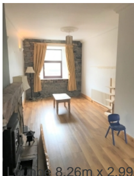
Lounge 8.26m x 2.99m with Feature Fireplace and Log Burner , Feature Stone Wall , Oak Flooring ,